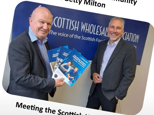
Meeting the Scottish Wholesale Association