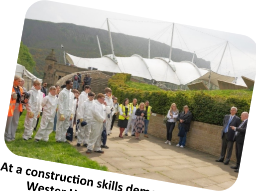
At a construction skills demonstration with Wester Hailes High School pupils