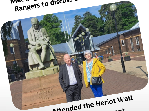
Attended the Heriot Watt Stakeholders event