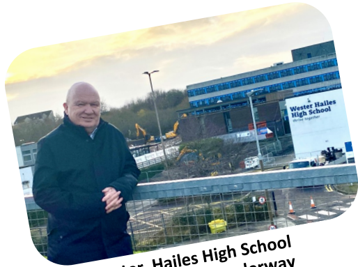
Wester Hailes High School Redevelopment Underway