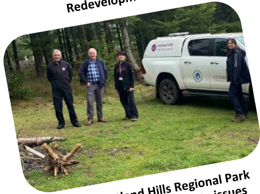
Meeting with Pentland Hills Regional Park Rangers to discuss outdoor safety issues