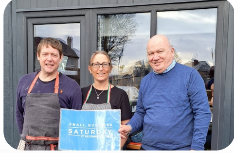
Meeting the owners of Sitooterie cafe at 'Small Business Saturday'